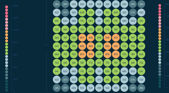
5x5 = 658 average PPFD