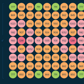
4x4 = 1,080 average PPFD

* Coverage area and average PPFD assumes lights are being used in a room with an array/grid of lights or in a tent/room with reflective walls.