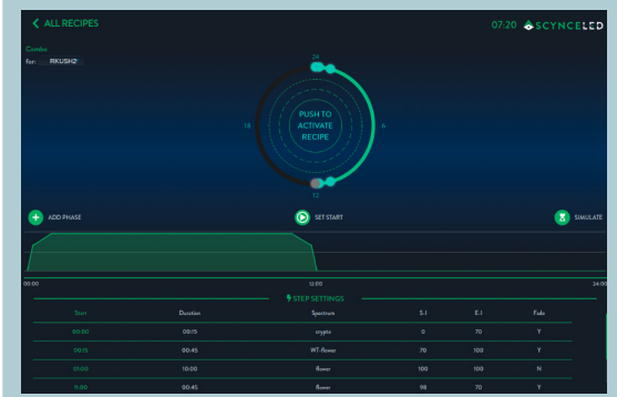
Schedules & Recipes